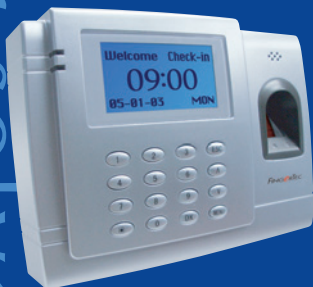
Model: AC101 / AC102 / AC103