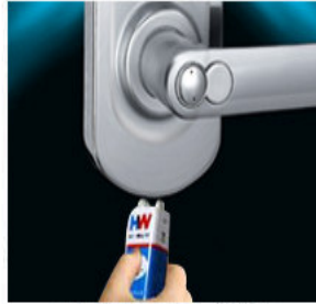
9V Extra Power restart lock